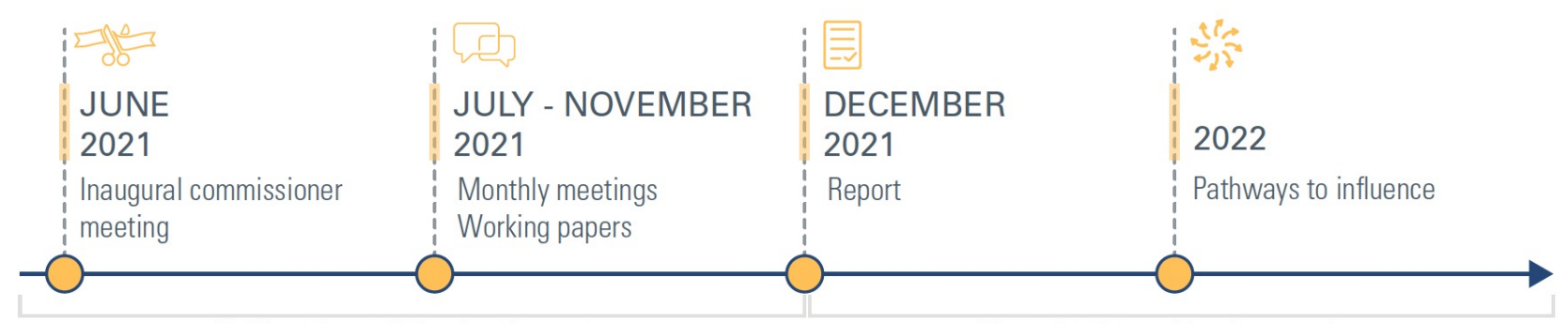
Deliberating and shaping the report